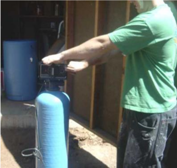
Screwing valve onto tank.

Make a list of all the plumbing fittings you will need to completely install the unit to make it ready for operation.