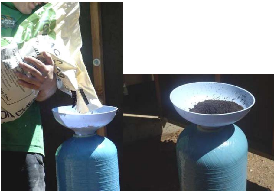
Adding resin to the tank.

resin to the tank, this will take about 10 minutes to do. After adding the resin, remove the cap, clean the threads on the tank with water were the valve screws onto, and screw the valve on, the tube will slip into the bottom of the valve hole as you are screwing that valve onto the tank.